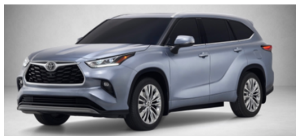
TOYOTA KLUGER HYBRID 2022