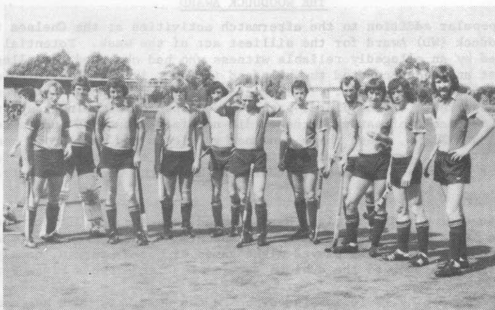
THE 1A's – GRAND FINALISTS '76 – from left: